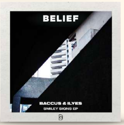
Smiley Signs EP w/ Ilyes [BELIEF] 2023