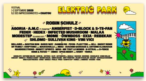
ELEKTRIC PARK, PARIS