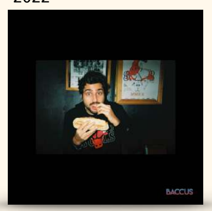
Oden & Fatzo - OB1 Kenobi (Baccus Remix) 2020