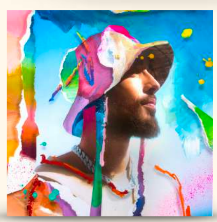
Amore (feat. Folamour) [House Of Love] 2023