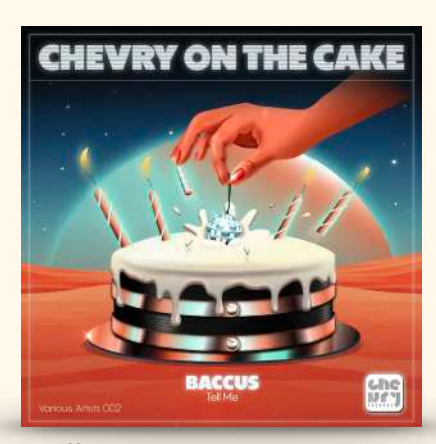
Tell Me [Chevry Records] 2023