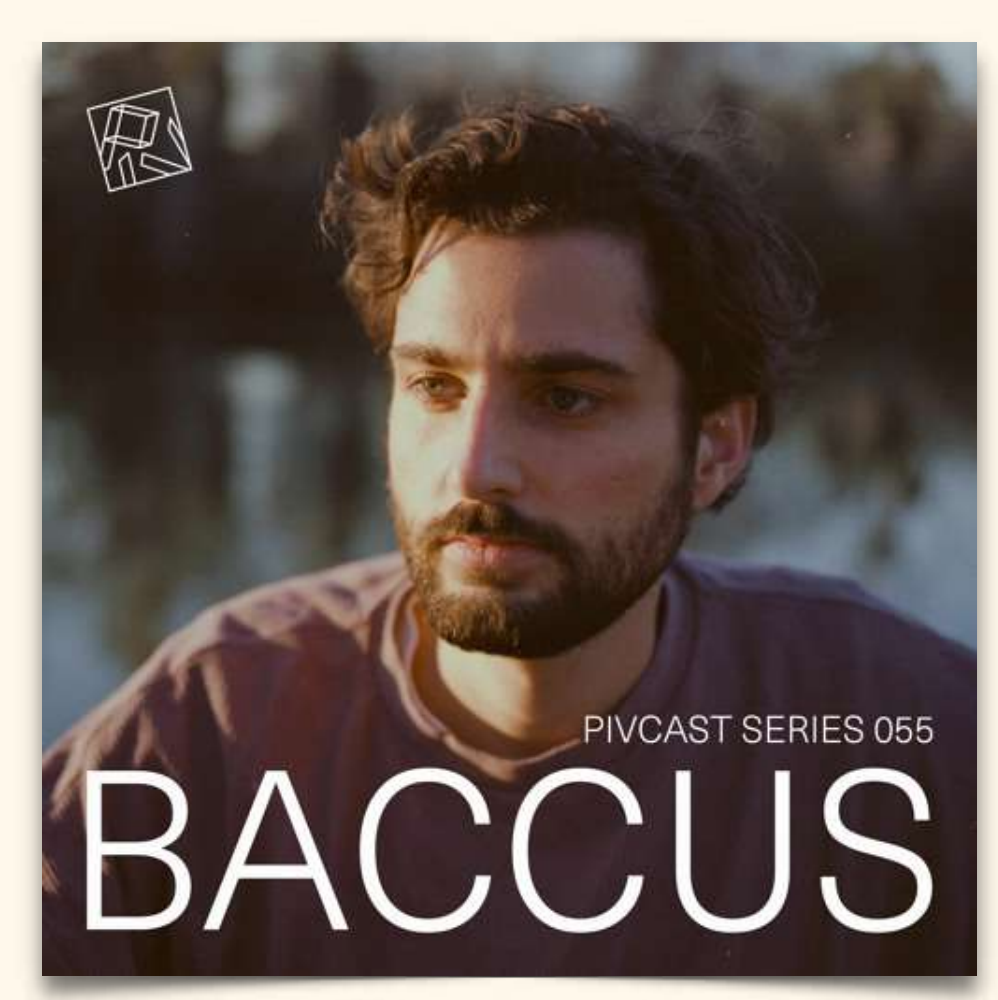
PIVCAST SERIES 055 MINIMAL HOUSE 2022