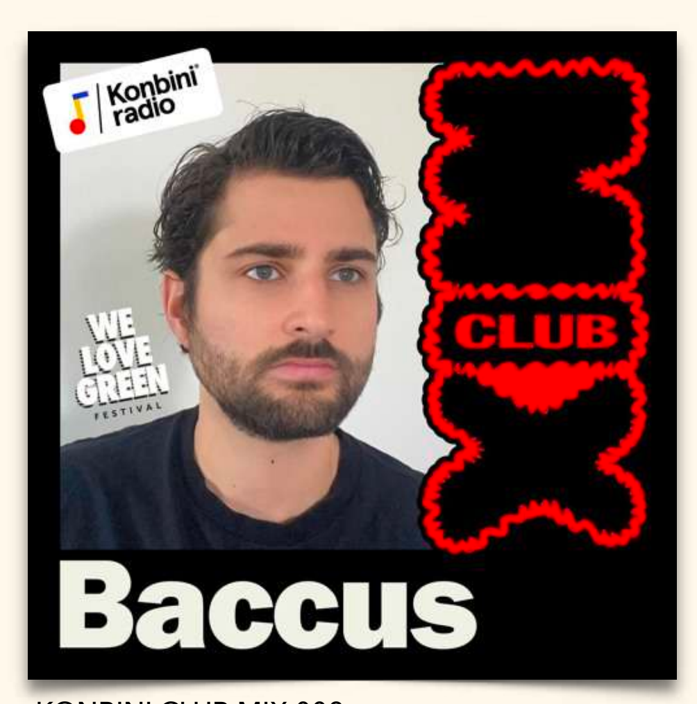
KONBINI CLUB MIX 008 FRENCH TOUCH 2023