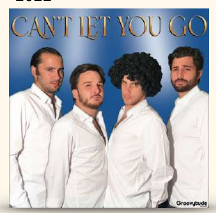
Baccus & Oden & Fatzo Can't Let You Go 2021