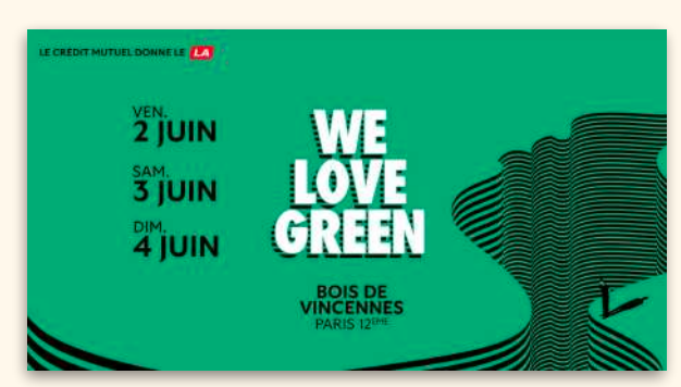
WE LOVE GREEN, PARIS