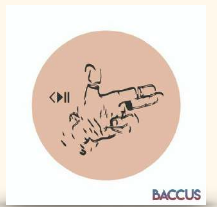
Sweely - Gotta Keep On (Baccus Remix) 2020