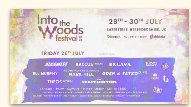
INTO THE WOODS, HEREFORD