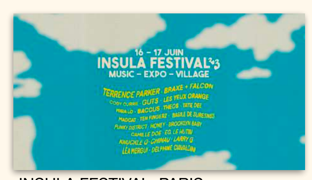
INSULA FESTIVAL, PARIS