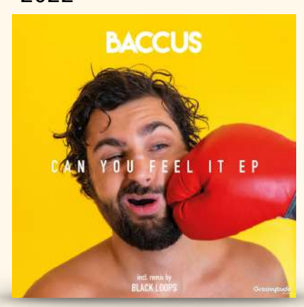
Can You Feel It [Groovytude Records] 2021