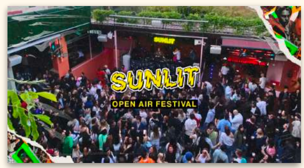
LA TERRAZZA, BARCELONA