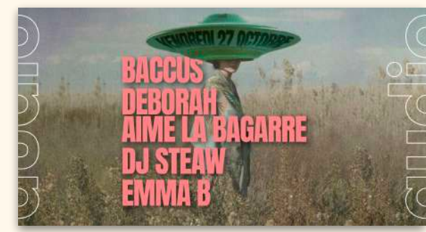
AUDIO CLUB, GENEVA