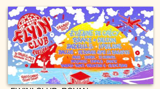
FLYIN' CLUB, ROYAN