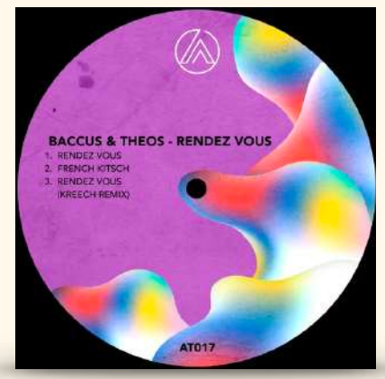
Baccus & THEOS Rendez-vous EP 2022