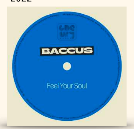
Feel Your Soul [Chevry Records] 2022