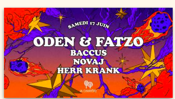
LA CLAIRIÈRE, PARIS