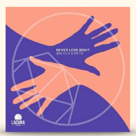
Never Lose Sight w/ PSTW [Lacuna Recordings] 2022