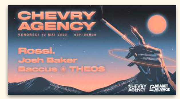
CABARET SAUVAGE, PARIS